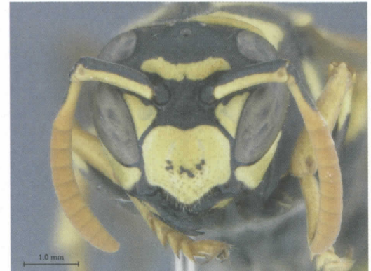
Above: The European paper wasp, Polistes dominulus , face front. Part of the Alien Wasps exhibition, at the Iziko South African Museum.

Cover Image: Mary Sibande. A terrible beauty is born , (2013) (Detail). Digital pigment print, 3270 x 1118 cm. From the 2013 Standard Bank Young Artist Award - Mary Sibande exhibition, Iziko South African National Gallery.